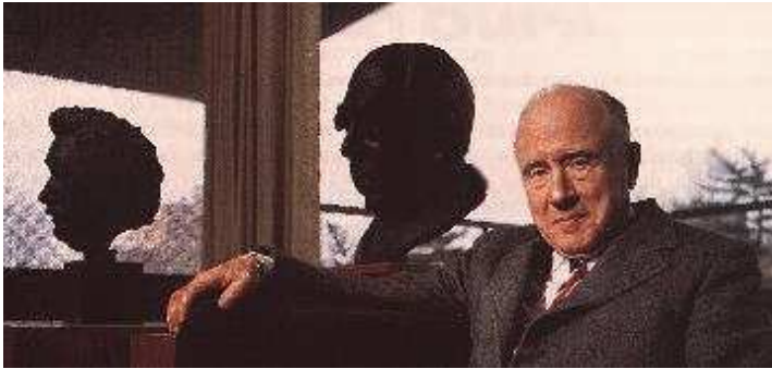
← John Archibald Wheeler

Another favourite gimmick of “hard SF ” authors [those who try to make their stories consistent with the known “Laws of Physics”] is the WORMHOLE, a sort of “space warp” analogous to the BLACK HOLE but topologically more interesting. One can distort [ e.g. fold] a 2-D surface (like a sheet of paper) embedded in a 3-D space until two apparently distant points are “actually” quite close together in the higher-dimensional continuum. Then a simple puncture across both sides will provide a “shrt cut” and drastically change the CONNECTEDNESS [a formal term in the mathematics of TOPOLOGY, believe it or not] of space. In a similar (?) fashion, one can imagine (?) a gravitational anomaly creating a “WORMHOLE” making a “short cut” connection between two nominally distant regions of 3-D space. Great potential for space travel, right?